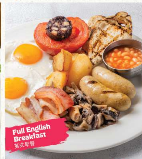
Full English Breakfast 英式早餐