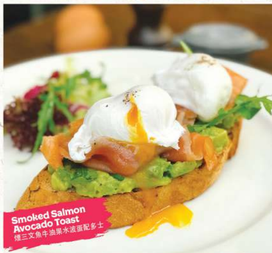
Smoked Salmon Avocado Toast 煙三文魚牛油果水波蛋配多士