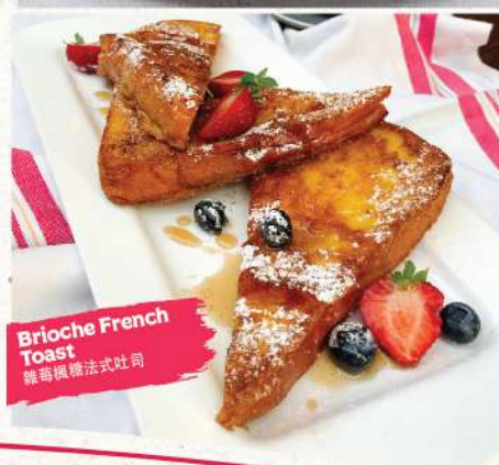
Brûlée French Toast 雜莓楓糖法式吐司

Parma Ham / Smoked Salmon / Smashed Avocado 巴馬火腿 / 煙三文魚 / 牛油果醬