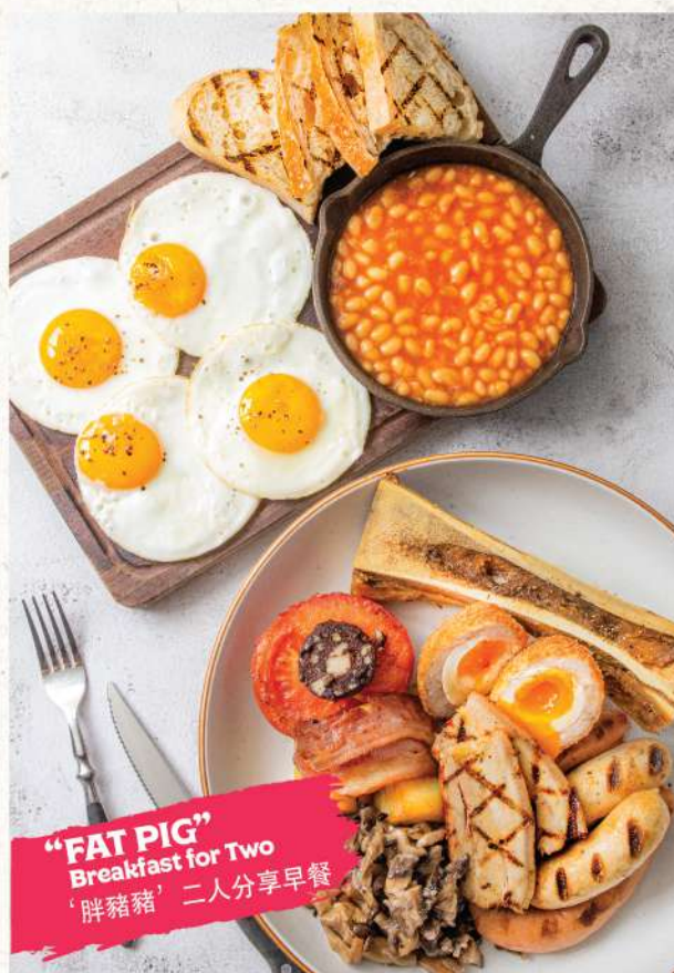
“FAT PIG” Breakfast for Two ‘胖豬豬’二人分享早餐

cinnamon sugar, strawberries, blueberries, maple syrup