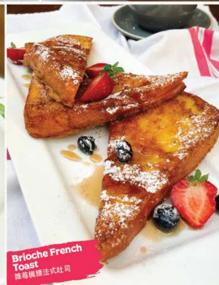
Brioche French Toast 雜莓楓糖法式吐司