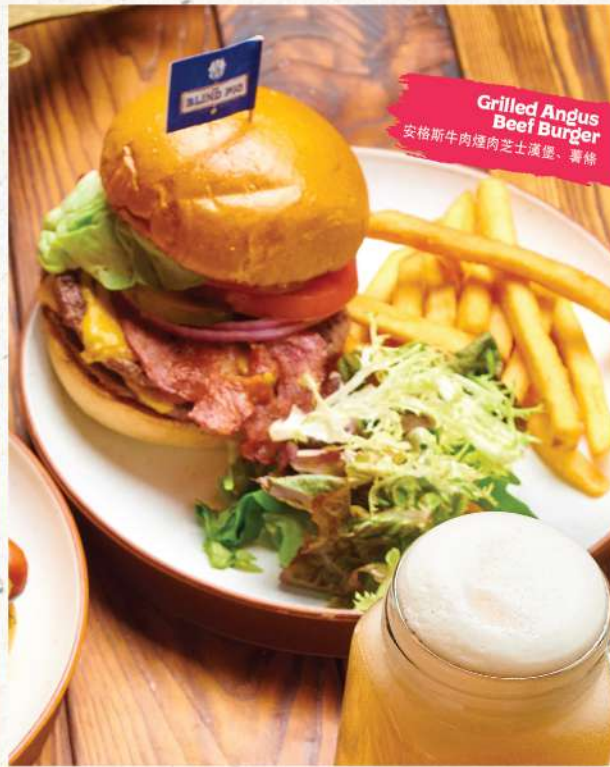
Grilled Angus Beef Burger 安格斯牛肉煙肉芝士漢堡、薯條