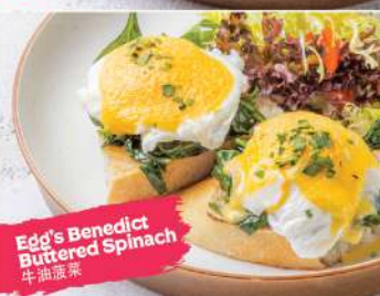
Egg's Benedict Buttered Spinach 牛油菠菜