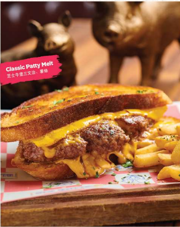
Classic Patty Melt 芝士牛堡三文治、薯條