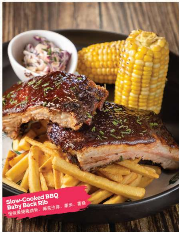
Slow-Cooked BBQ Baby Back Rib 慢煮醬燒豬肋骨、椰菜沙律、粟米、薯條