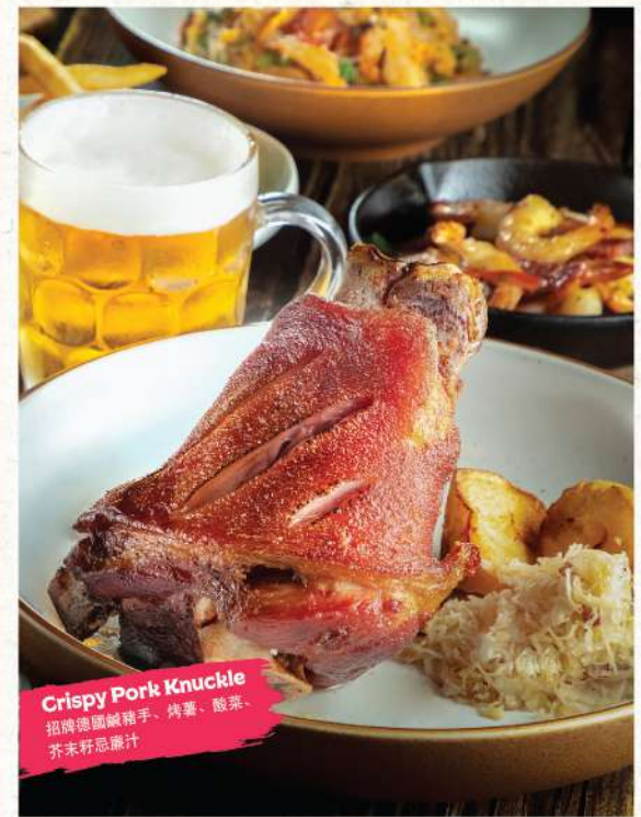
Crispy Pork Knuckle 招牌德國鹹豬手、烤薯、酸菜、芥末籽忌廉汁