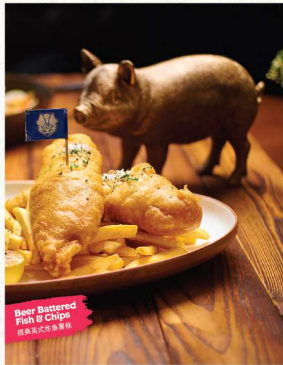
Beer Battered Fish & Chips 經典英式炸魚薯條