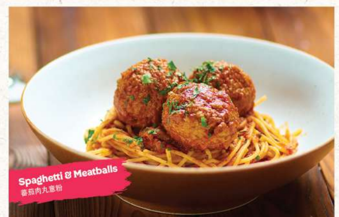
Spaghetti & Meatballs 蕃茄肉丸意粉