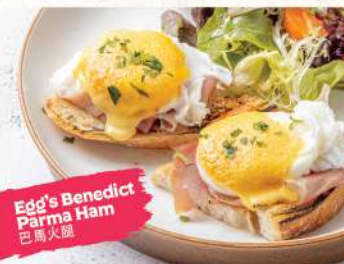
Egg's Benedict Parma Ham 巴馬火腿