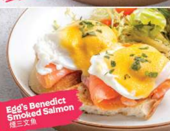
Egg's Benedict Smoked Salmon 煙三文魚